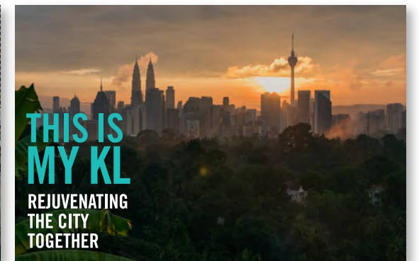
The story of KL's evolution from a muddy river confluence to a dynamic and vibrant city