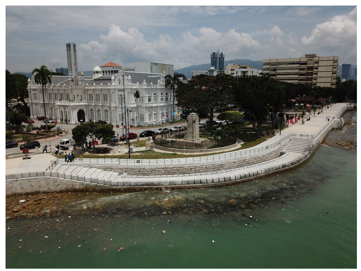
Completed Seawall Upgrading & Promenade