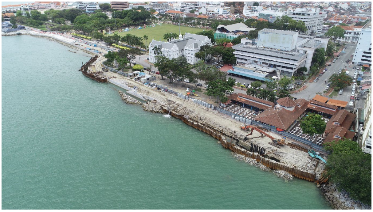
Seawall Upgrading: Under construction