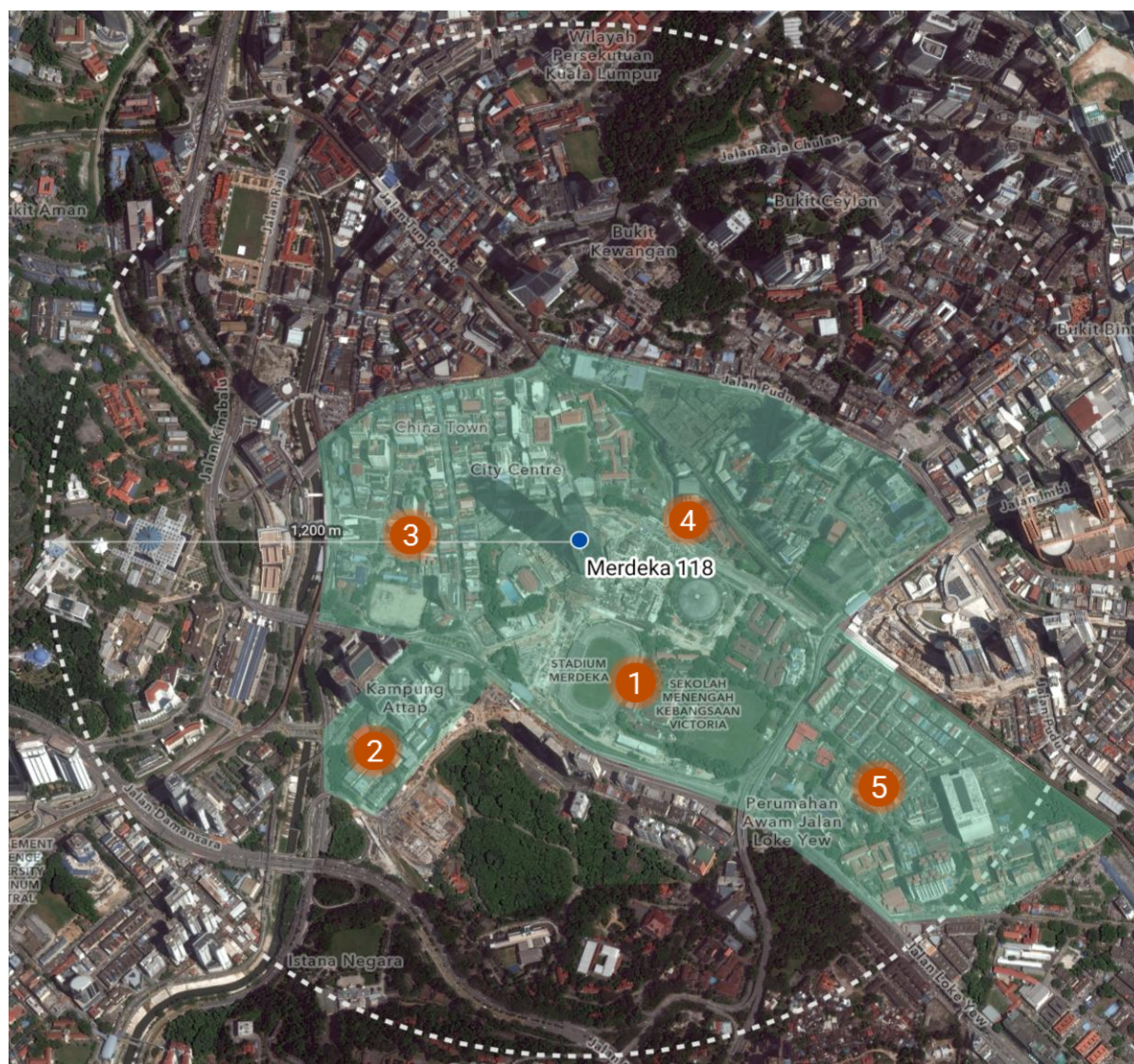
Map 1.0: Light green indicates the focus area; the dotted circle marks the buffer zone boundary.