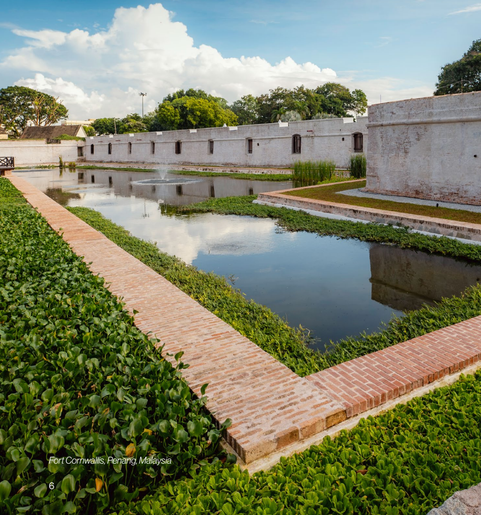
Fort Cornwallis, Penang, Malaysia

The reinstated Fort Cornwallis moat, buried for over a century, is now a 4,000 square metre water basin that manages flood drainage and returns civic space to the city.