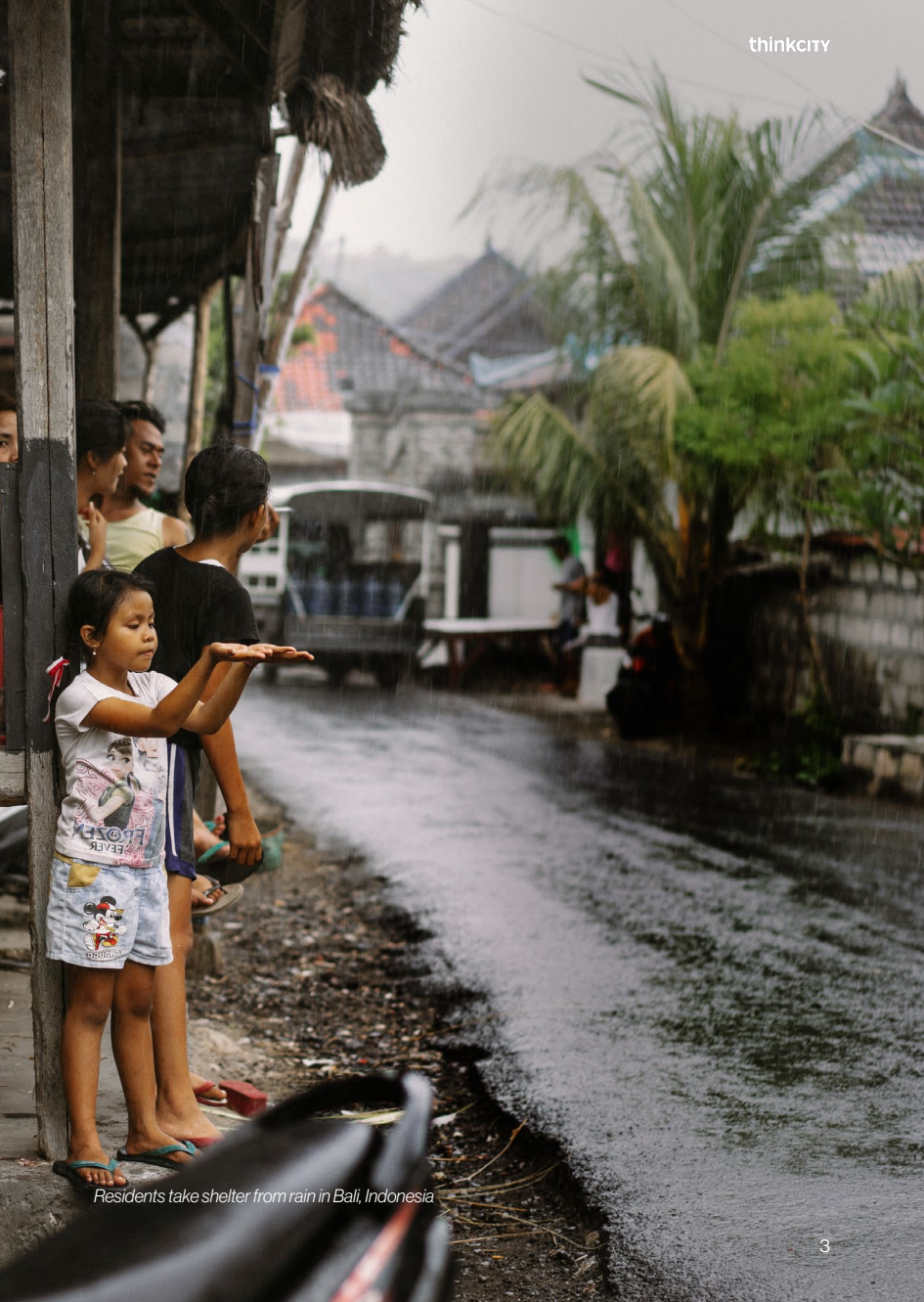
Residents take shelter from rain in Bali, Indonesia