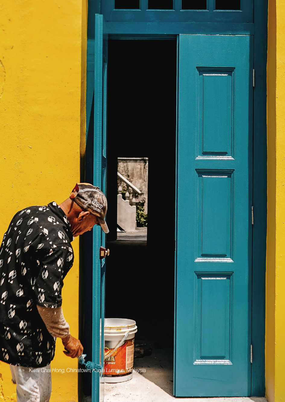
Kwai Chai Hong, Chinatown, Kuala Lumpur, Malaysia