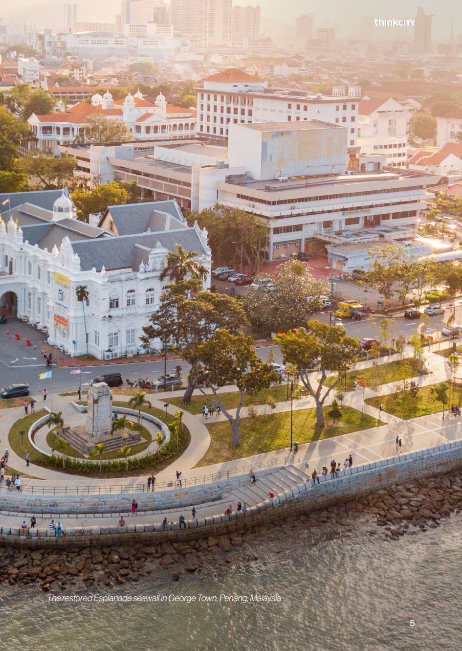
The restored Esplanade seawall in George Town, Penang, Malaysia