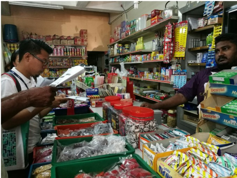
Enumerators conducting their surveys.