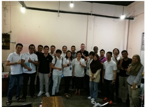
Group photos of enumerators involved in the baseline study.