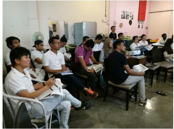
Enumerators at briefing sessions.